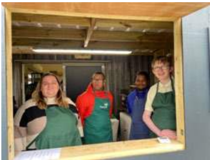
We recently had our lifeskills students running the snack shack for the day, as part of their work experience.

To make this easier, our outside snack shack (on the outside patio) will be open on busier days. You will be able to purchase cold drinks, ice creams and snacks from here. This will reduce queues and hopefully mean it's easier to also just grab something small. Please continue to order your meals and hot drinks via the normal cafe serving hatch. We hope this helps.