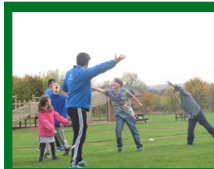
Ignite Sport Saturday 4th February, 1-2pm Quidditch, 1-2pm